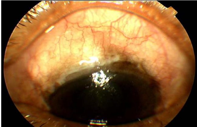
Fig. 1: Glaucoma refractory to trabeculectomy